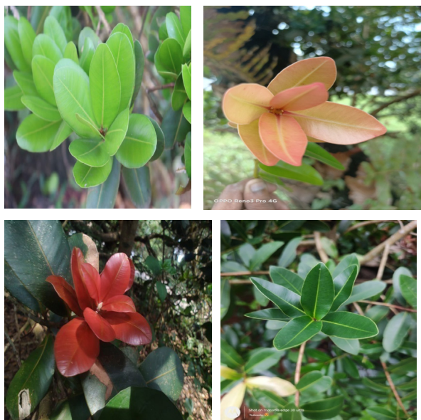
Figure 1: leaf flushing stages of C. apetalum

Calophyllum apetalum is a moderately sized evergreen tree with a height of 9 to 10 metre. The tree requires moist soil that is rich in organic matter and can grow well in light shade with sufficient rainfall. The common stature of the tree is straight, with a cylindrical stem and a girth ranging between 4.5 and 5 metre.