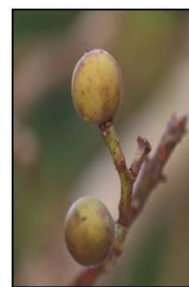
Figure 7: Mature fruits of C. apetalum

The fruit is an indehiscent drupe, ovoid or globose, with a dry mesocarp and stony or spongy endocarp. It contains one seed, with large cotyledons, exalbuminous and with rich oil content. Following pollination and fruit set, fruit initiation occurs. The fruit matures within 2 to 3 months (November to January). In C. apetalum , peak fruiting is observed during January, when the maximum number of flowers becomes