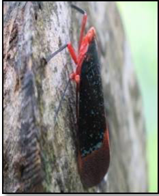
Figure 5: Common treehopper associated with C. apetalum

with their DBH (Diameter at Breast Height) - Alappuzha) (Table: 2). The bark serves as a storage space for water due to this peculiar quality of the structure. Many plants are associated with the tree, such as Bulbophyllum Sp ; (Fig: 3a), Vanda tessellata (Roxb) Hook. ex.G.Don (Fig:3b), Pothos scandens (L.) (Fig: 3c), Polyporus Sp. (Fig: 3d), Cuscuta reflexa Roxb. and Pyrosia heterophylla (L.) M. Price inhabits the tree. On the bark, lichens, bryophytes, pteridophytes and even common treehoppers (Fig. 5) can be seen. The roots are