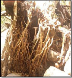
Figure 4: Extensive root system of C. apetalum