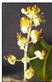
Figure 6: Inflorescence of C. apetalum

highly extended to absorb water, forming a large network around the tree (Fig. 4). Flowers are bisexual, creamy white, with petals absent. Stigma is peltate with entire margins, about 1 to 1.5 mm across (Inflorescence - Fig: 6).